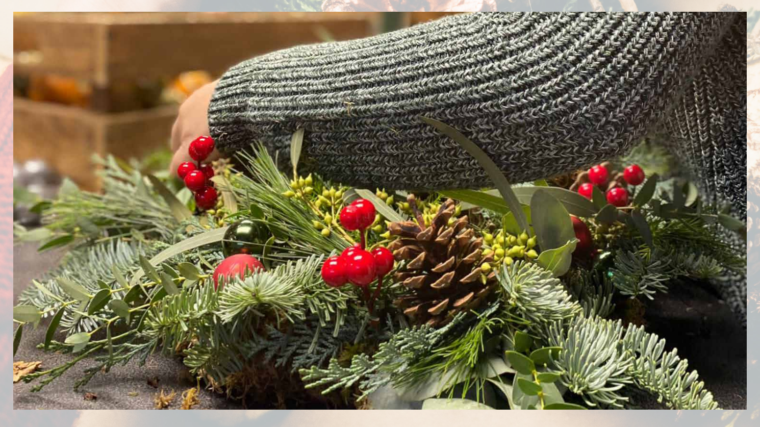
The workshops are already underway for 2022 in our Hemel Hempstead shop

It's the time of year where we transform our workshop into a winter wonderland and invite people in to create their own festive door wreath. Every year our workshops are a sell out as friends come together to enjoy the festive atmosphere.