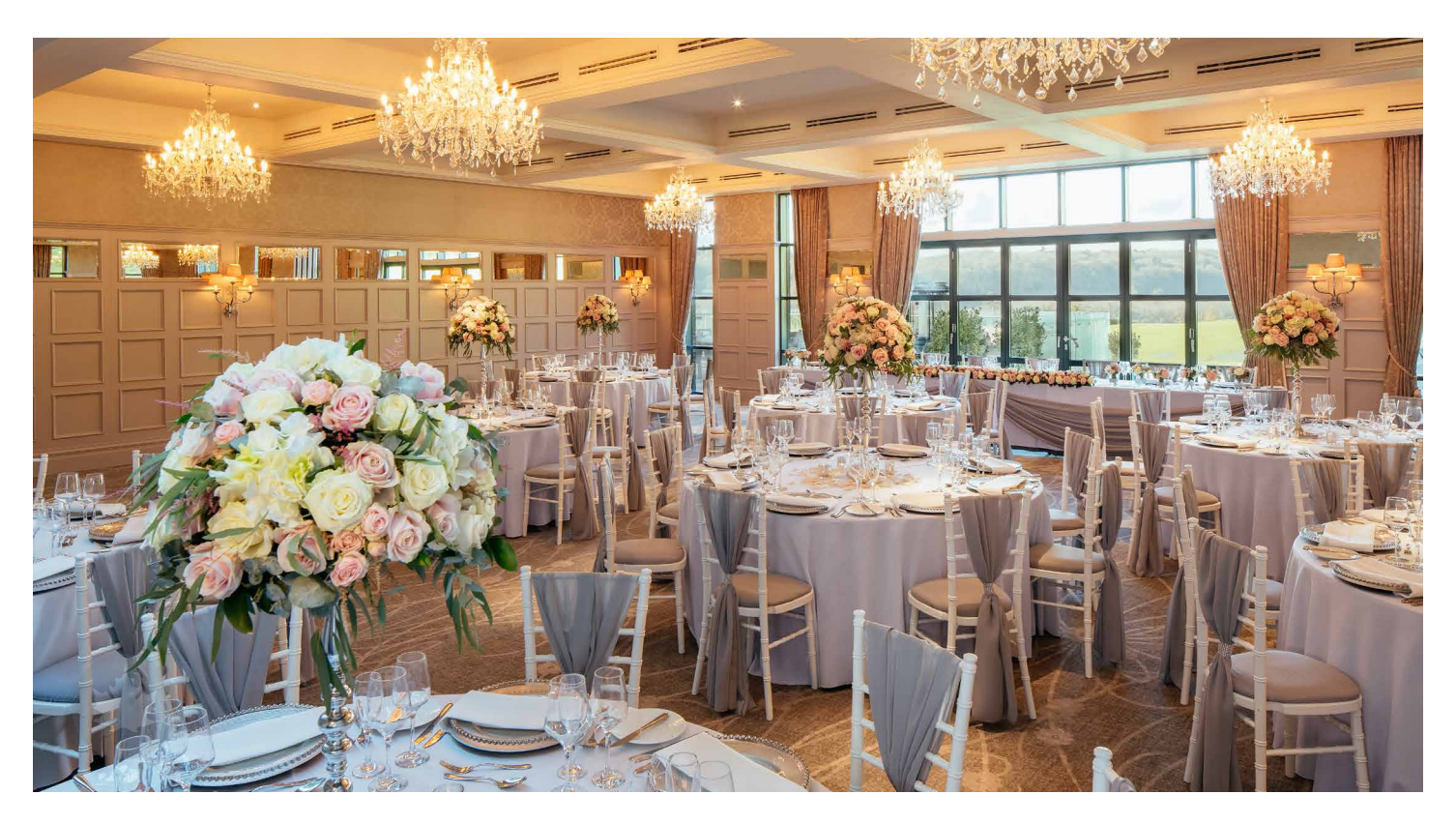
Ready for a reception at Latimer Estate with Maples Flowers

Maples Flowers are proud to work so closely with many great wedding venues and DeVere Latimer Estate is one of our favourites. The beautiful hotel is surrounded by stunning grounds with a church in the picturesque Buckinghamshire countryside